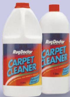
CARPET CLEANER 1LTR & 2LTR