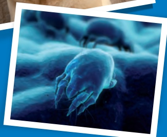
Carpet bug, magnified