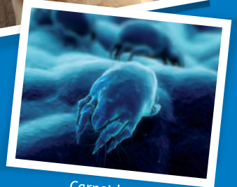
Carpet bug, magnified